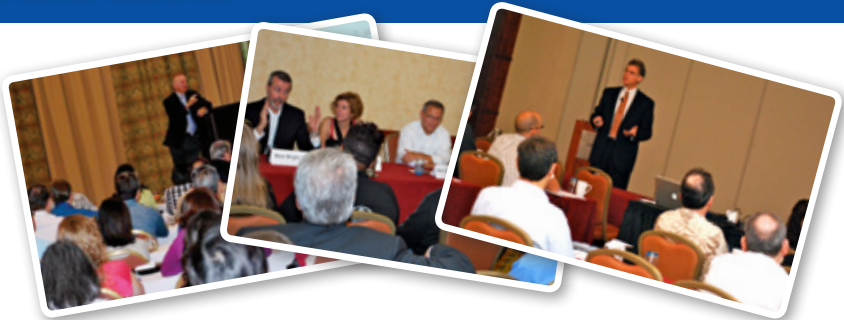
Harbor Beach Marriott Resort & Spa, Ft. Lauderdale, FL

At PIO 2011 you will get strategies for success, advice from nationally renowned experts, and camaraderie with your colleagues. Best of all, you will leave with the tools you need to build a world-class staff!